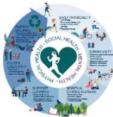
Benefits of addressing wellbeing

The wellbeing design factors for student residential accommodation are deeply embedded in the One Planet Living framework