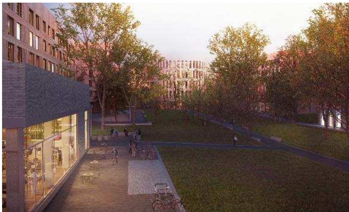
View within North Court from Supermarket towards the library