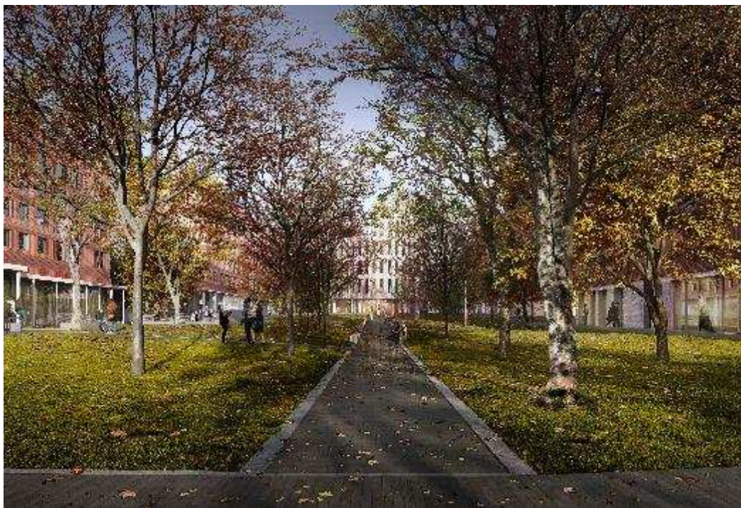
Visual from South to North within North Court towards the library